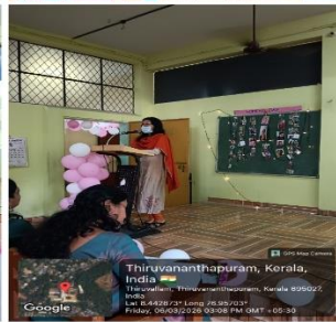
Thiruvananthapuram, Kerala, India Thiruvallam, Thiruvananthapuram, Kerala 695027, India LAT 8.462923° Long 76.957023° Friday, 09/03/2023 02:29 PM GMT +05:30