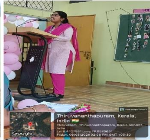
Thiruvananthapuram, Kerala, India Thiruvallam, Thiruvananthapuram, Kerala 695027, India LAT 8.462928° Long 76.957024° Friday, 09/03/2023 02:29 PM GMT +05:30