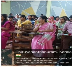
Thiruvananthapuram, Kerala Thiruvallam, Thiruvananthapuram, Kerala 695 LAT 8.46295° Long 76.95698° Friday, 09/03/2023 02:24:33 PM GMT +05:30