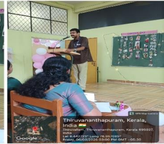
Thiruvananthapuram, Kerala, India Thiruvallam, Thiruvananthapuram, Kerala 695027, India LAT 8.462723° Long 76.957020° Friday, 09/03/2023 02:30 PM GMT +05:30