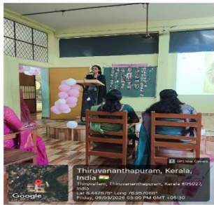
Thiruvananthapuram, Kerala, India Thiruvallam, Thiruvananthapuram, Kerala 695027, India LAT 8.462978° Long 76.957024° Friday, 09/03/2023 02:28 PM GMT +05:30