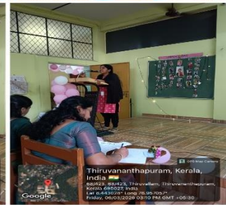
Thiruvananthapuram, Kerala, India Thiruvallam, Thiruvananthapuram, Kerala 695027, India LAT 8.462723° Long 76.957020° Friday, 09/03/2023 02:30 PM GMT +05:30