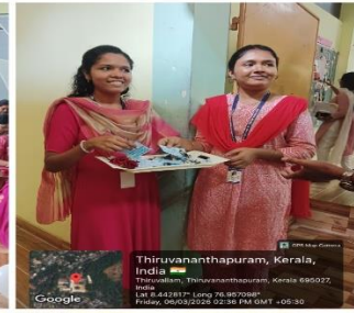
Thiruvananthapuram, Kerala, India Thiruvallam, Thiruvananthapuram, Kerala 695027, India LAT 8.462811° Long 76.957050° Friday, 09/03/2023 02:36 PM GMT +05:30