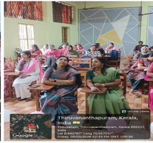
Thiruvananthapuram, Kerala, India Thiruvallam, Thiruvananthapuram, Kerala 695027, India LAT 8.462797° Long 76.957037° Friday, 09/03/2023 02:43 PM GMT +05:30